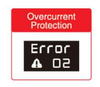
Load current over16A