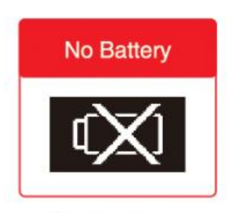
No battery install the battery Screen flashing 10s