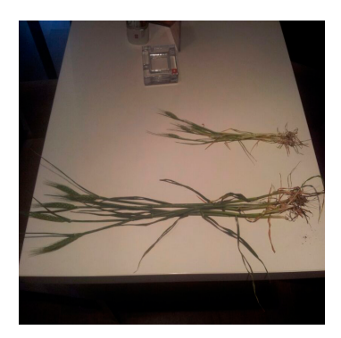
Figure 1. The effects of foliar application of PEG-sSA on wheat grown in very saline soil (area of 3 ha) in Romania during 2014. Half of the plot was sprayed four times with AB Yellow<sup>®</sup> (=4 mL/L PEG-sSA plus B, Mo and Zn). The visual differences between the sprayed plants (taller plants) and the control (small plants) can be seen.

Abbreviations: in column 'Type of trial': RCBD (randomized complete block design with at least 3 replications), ET (extension trials in cooperation with scientific institutes) and FT (farmer's trials in cooperation with scientific institutes). In the column 'Remarks' the results show the efficacy against abiotic stress (acidic and saline soil), biotic stress (decreased infection rate) and on quality, e.g., significantly higher brix, TSS, lycopene and vitamin C content (tomato), protein content (wheat) and fruit firmness (eggplant).