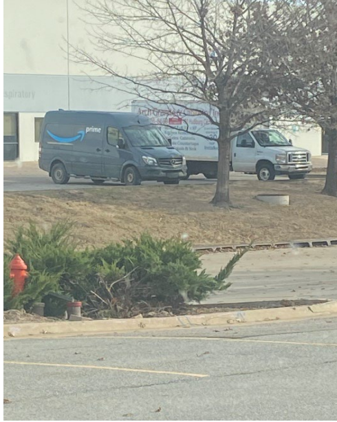
Above: Photo of the Van

12. YE drives the Amazon Van to visit Oklahoma-based marijuana grows where large black trash bags containing vacuum-sealed packages of marijuana are loaded and transported to initial stash houses controlled by YE. At the initial stash house, law enforcement believes that the marijuana is re-packaged and then transported to one of two warehouses that have been identified by law enforcement as being controlled by YE. At the warehouses, it appears that a semi-truck is loaded about once a week with the marijuana for transportation out-of-state.