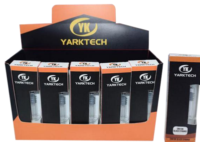
#6 – Display box