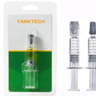
#15 - Blister packaging