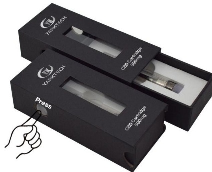
#14 - Childproof packaging