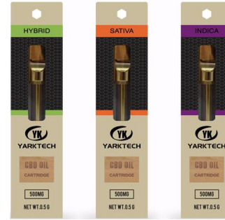
#11 - O Pen box