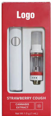
#13 - Starter kit box