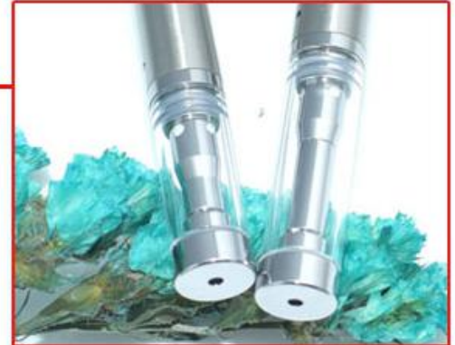
High clarity quartz glass