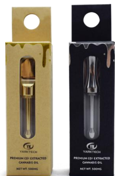
#2 – Hang Tag box