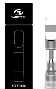
#7 – Cigarette box