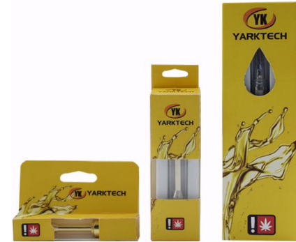
#12 - Golden box