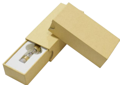
#5 – Craft box