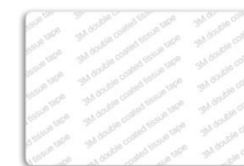
3M double coated tissue tape