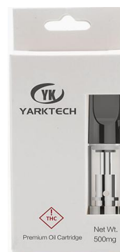
#3 – Paper box