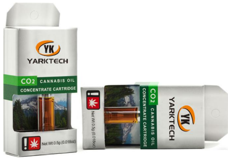
#9 - Retail Packaging