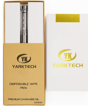
#10 - Three kits box