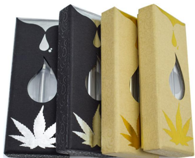
#1- Set up box