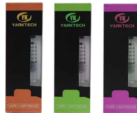
#4 - Side sleeve box